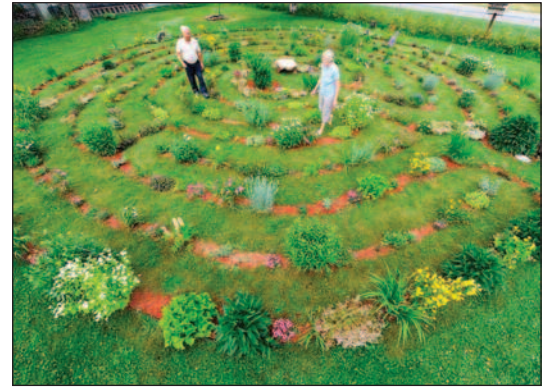
Tranquil Spirit, Cameron 7-circuit, 60-ft. diam, grass paths, 500 perennials line walls, centre 8-ft. diam. with meditation rock and Rose of Sharon bush.