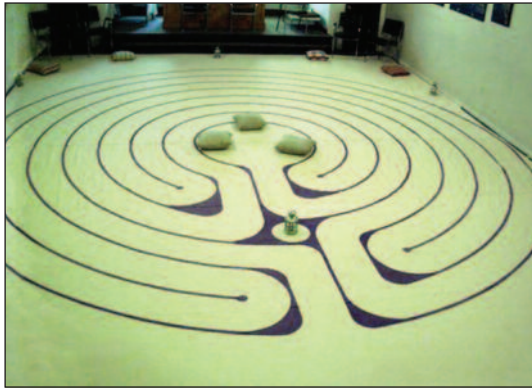
Beverly Chen, Ottawa Purple lines painted on 7-circuit portable plain canvas.

See the LCN website for a growing list of labyrinth facilitators, books, children's activities, articles, interesting links, and much more.