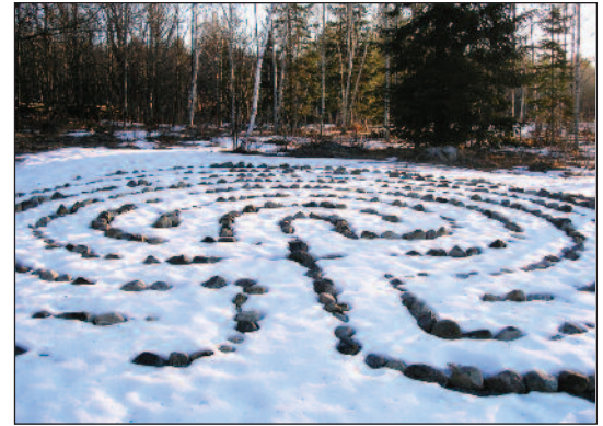
Mandala Gardens, McKellar 7-path Hopi labyrinth built of stone on sand Learn more about the Hopi design at www.mandalagardens.ca .