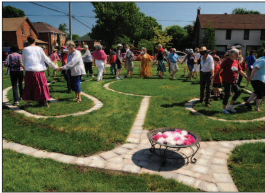
Carlton Place Community Labyrinth, Carleton Place A chain dance at dedication. Classical style, 7-circuit. Inspirational stones set into the pathway lead to a pausing stone at entrance.